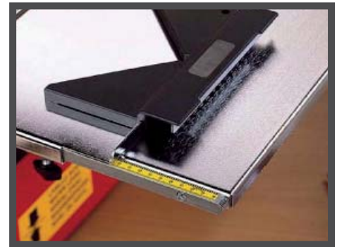
SIDE FENCE FOR IDENTICAL CUTS